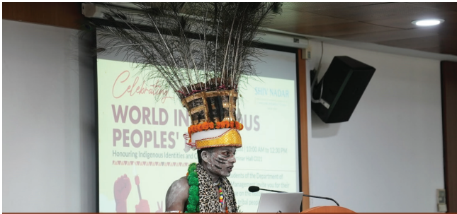
A student from the Particularly Vulnerable Tribal Group - Kolam tribe, performing a rap song in Marathi about the environmental costs of development borne by the tribal people.