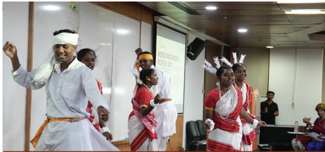
Students from the Tea Gardens of Jalpaiguri district of West Bengal performing a Sadri (Chota Nagpuri) dance at the World Indigenous Peoples' Day celebration.